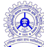
IIT (ISM) Dhanbad